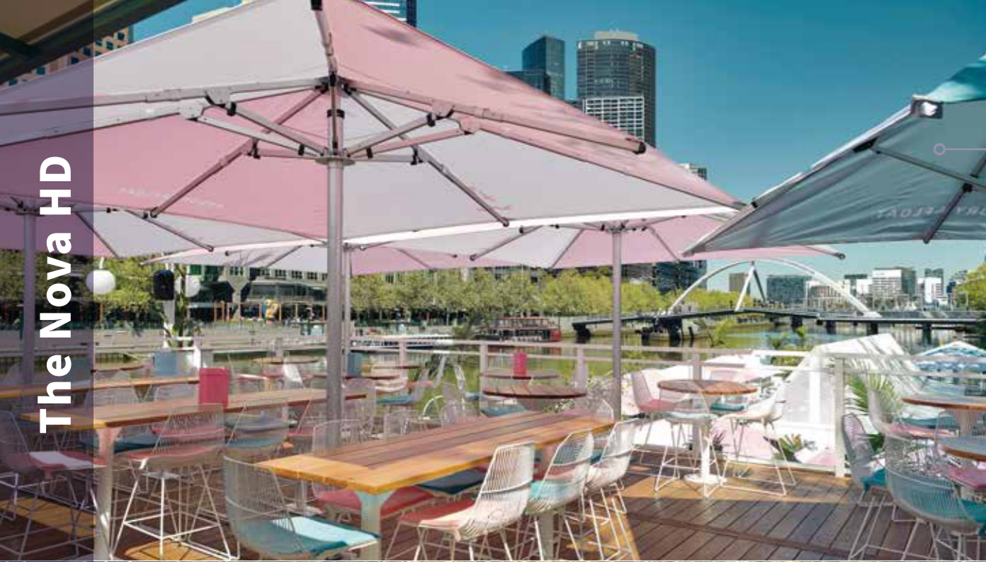
The Nova HD