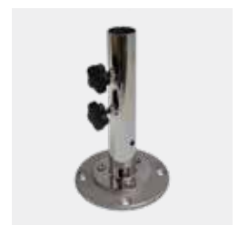
CAM-LOCK PLATE & SPIGOT