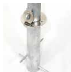
IN-GROUND SOCKET & SLEEVE KIT