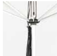
50mm DIAMETER POLE

Frames are made of Marine Grade Anodised Aluminium with a 3 year warranty against mechanical defects.