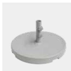
GREY CONCRETE BASE